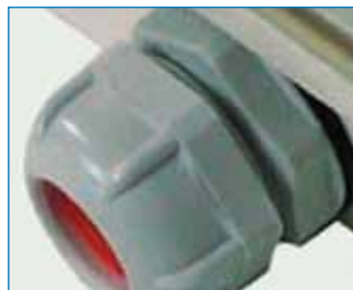
Weatherproof model available