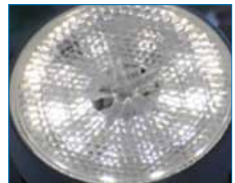
LED technology of 2000 lumens light output