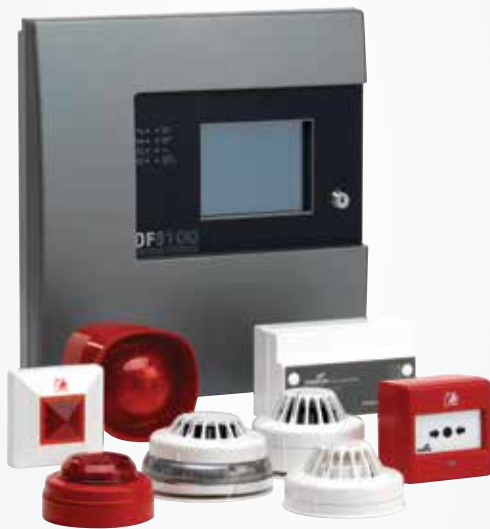
DF6100VDS pictured with a range of compatible devices